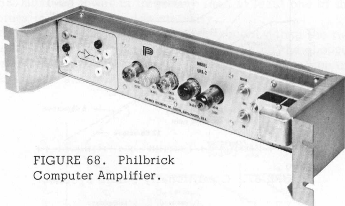
FIGURE 68. Philbrick Computer Amplifier.

Computer amplifiers similar to those just described have become available from a number of sources. One such is the Philbrick Type UPA-2, a chopper stabilized operational amplifier shown in Figure 68. Figure 69 pictures an operational amplifier manufactured